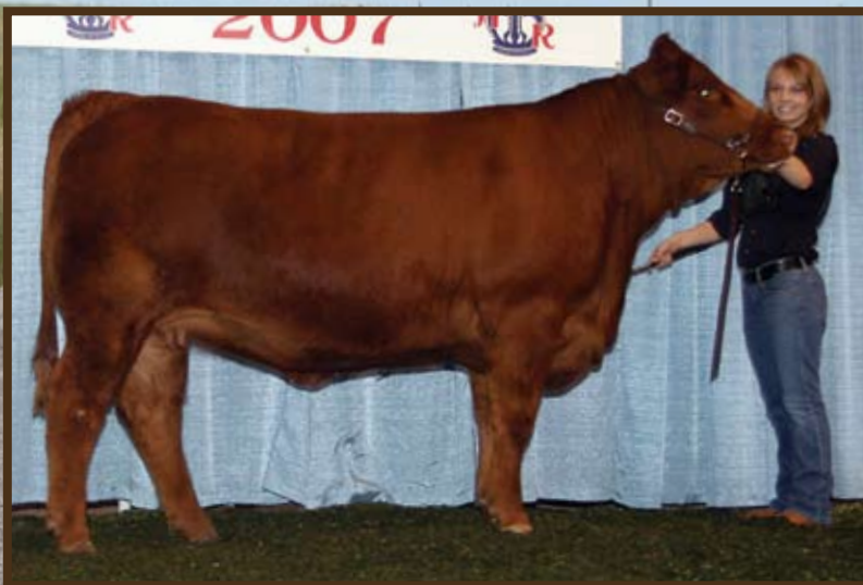
KKKG Reeba 173R